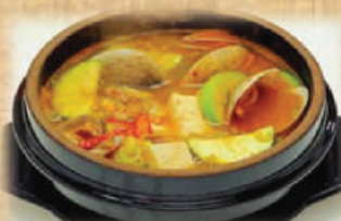
99. 차돌 된장찌개 Chadol Daenjang Jjgae Fermented soybean paste stew with beef AED 65