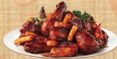
33. Volcano Oven Chicken

29. 볼케이노 오븐 치킨 Volcano Oven Chicken AED 110 (good for 2 Persons)