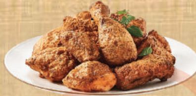
29. Original Baked Chicken

25. 오리지널 베이킹 치킨 Original Baked Chicken AED 100 (good for 2 Persons)