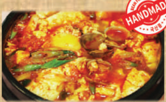
101.순두부찌개 Sundubu Jigae Soft Tofu stew. AED 65