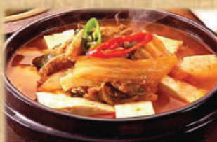
98. 김치찌개 Kimchi Jjgae Spicy Kimchi stew. AED 65