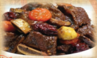
63. 갈비찜 "Galbi-Jjim"