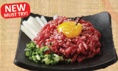
66. 육회 "Beef Sashimi"

Fresh beef marinated with special sauce (beef tartar).