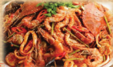
61. 해물찜 Sea Food Jjim

Famous Korean braised spicy seafood and other seasonal catches.