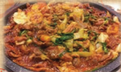
64. 오리불고기 Ori Bulgogi (Soy Sauce or Spicy)

Thinly sliced marinated duck cook it yourself on a grill.