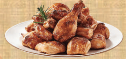
30. Original Roasted Chicken

26. 오리지널 로스트 치킨 Original Roasted Chicken AED 100 (good for 2 Persons)