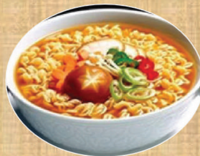
125. Madang Ramen