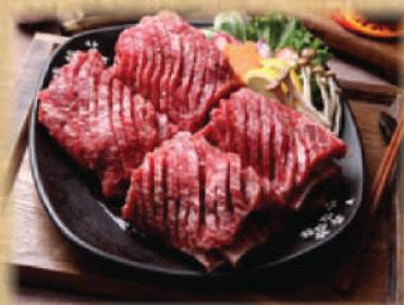
12. Saeng Galbi