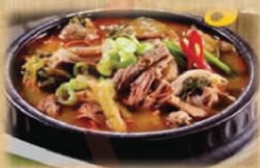
90.양보탕 Yang Bo Tang Lamb Soup served in hot pot. AED 75