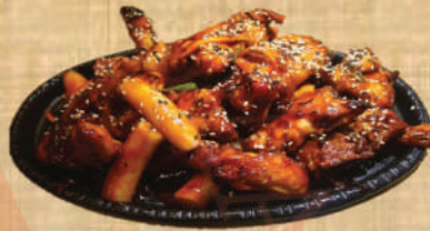
31. BBQ Chicken

27. 숯불 바비큐 치킨 BBQ Oven Chicken AED 110 (good for 2 Persons)