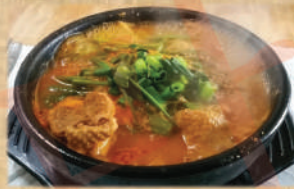
91. 오리탕 Ori Tang Duck soup served in hot pot. AED 70