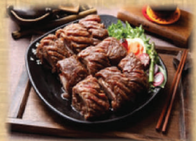
13. Yangnyom Galbi

*Prices are in UAE Dirham(AED) 5% VAT *모든 가격은 5% 세금 포함된 금액입니다 ©2015-2024 Madang Korean Restaurant. All rights reserved. Copyright infringement will lead to legal actions.