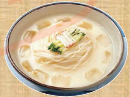
123. Kong Guksu