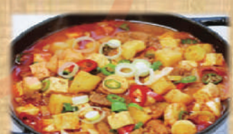
97. 고추장찌개 (짜글이) Gochujang Jjgae (Jjageuri) Spicy stew with pepper paste. AED 65