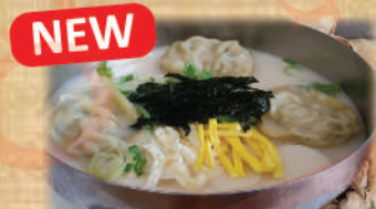
NEW 96.떡만둣국 Tteok Mandoo Guk Dumpling and rice-cake soup. AED 70