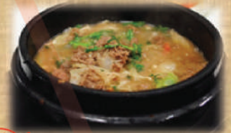
RECOMMENDED 93. 뚝배기 불고기(뚝불) Ddukbaegi-bulgogi (Dduk-bul) Bulgogi soup. AED 70