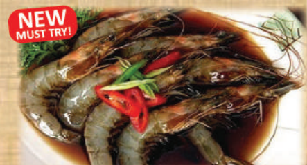
68. 간장새우 "Ganjang Saewoo"

Fresh shrimps marinated in unique soy sauce (3pcs).