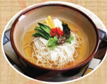
122. Janchi Guksu