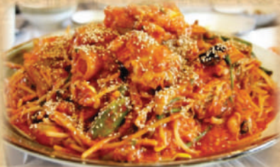
60. 아구찜 "A-Gu Jjim"

Special spicy fish dish made with agu (monkfish) and kangnamul (soybean sprouts).