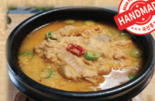
100.마당 비지찌개 (Madang) Home-made Tofu Soup Bean-curd dregs soup. AED 65