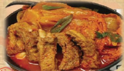
62. 등갈비 김치찜 Back Ribs Kimchi Jjim