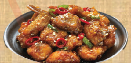
32. Garlic Oven Chicken

28. 갈릭 오븐 치킨 Garlic Oven Chicken AED 110 (good for 2 Persons)