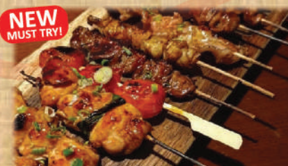
67. 마당 모듬꼬치 "Madang Skewer"