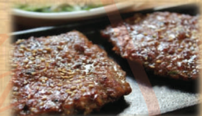
65. 떡갈비 "Duk Gal bi"

*Extra order 볶음밥 Fried Rice: AED 15 AED 220 (good for 2-3 Persons)