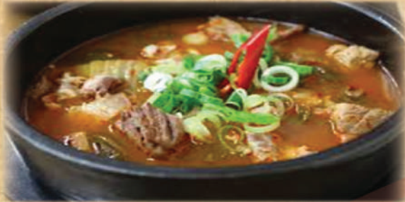
87. 소고기국밥 Sogogi Gukbap Spicy beef soup.