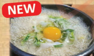
NEW 95.콩나물 황태 해장국 Hwang Tae Haejanguk Dried pollock fish and bean sprout soup. AED 70