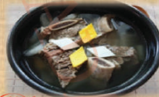
RECOMMENDED 92. 갈비탕 Gal-Bi Tang Beef short Rib soup with Rice. AED 70