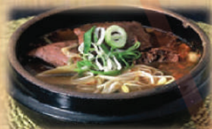
94.뼈다귀 해장국 Haejanguk Thick, spicy beef soup w/ soybean paste. AED 70